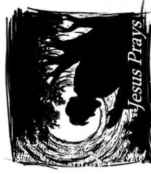
Jesus Prays in Gethsemane

Novena will begin on Good Friday, April 2 at 8:30 a.m. and each day follow- ing daily Mass and concludes on Divine Mercy Sunday April 11. Watch the bulletin for the dates and times.